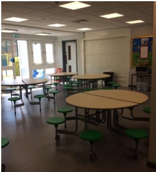
The Dining Hall